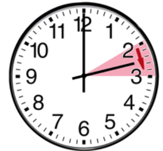
Image: clock showing setting time ahead one hour for Spring.

Set your clocks ahead one hour before you go to bed on Saturday the 7 th and you’ll be ready for Spring!